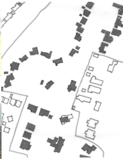
Figure ground showing the grain and urban pattern of a residential development