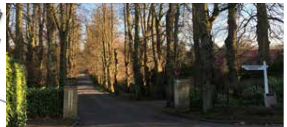
The conservation area which forms the backdrop to the proposed Sevenoaks residential development