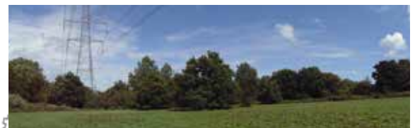
Site for proposed agricultural development close to an overhead transmission line within the High Weald AONB