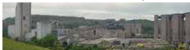
Brownfield site for proposed new cement works in Medway valley