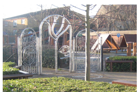
Haymerle School, Peckham, London

Play projects include Southfield Road, Rusthall, Tunbridge Wells, Showfields Estate, Tunbridge Wells, and various playgrounds in Medway.