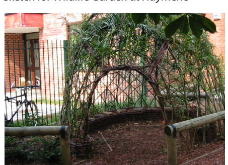
Woven willow at Dulwich Village School