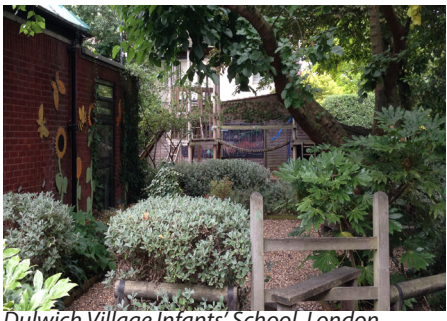
ch Village Infants' School, London