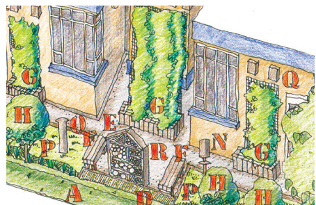
Sketch for Wildlife Garden at Haymerle