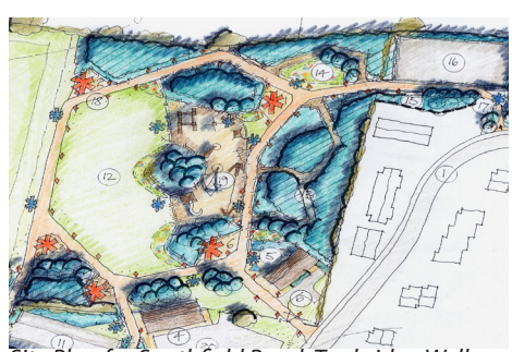
Site Plan for Southfield Road, Tunbridge Wells